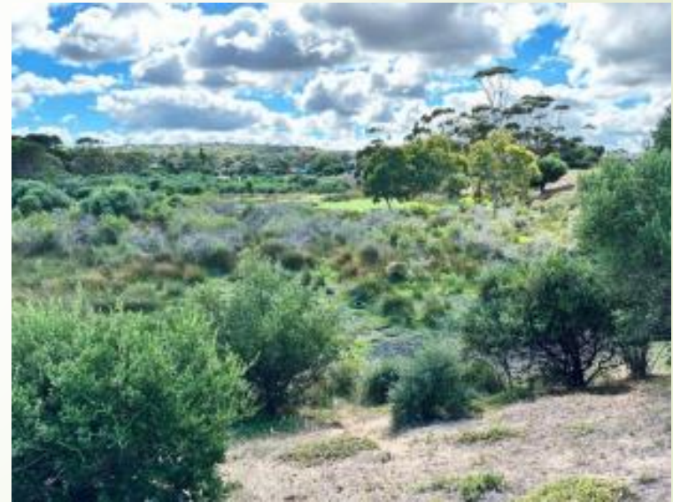
Zone 2 – Standing on Croser Wetlands