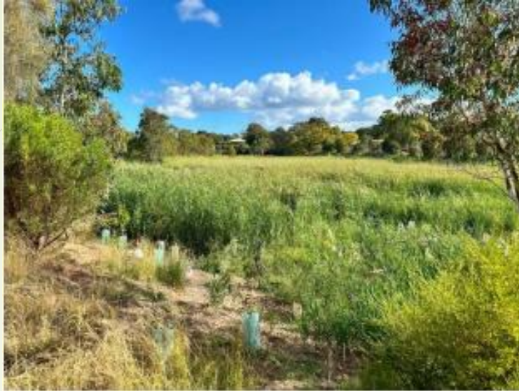
Zone 1 – Section near Hay Flat Road